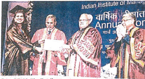
Guv SP Malik distributing medals and certificates to students at 2nd Annual Convocation of IIM Jammu.

On March 23, this erratic NC leader already known for his brazenness, unfounded and unnatural statements threw all ethics to winds when he declared that he wasn't ashamed of lauding Pakistan. "Wo ausalman mulk hai, wo abaad rahay, hamari aur unki basti baday, uss dosti ka mal ashiq hun... Agar unko koi k gali dega mai unko yahan se dast galyan dunga," he said in his address. Meanwhile, it is emerging as a new trend in Kashmir that otherwise mainstream politicians are posing as separatist sympathisers with a sole motive to garner votes and appease separatists.