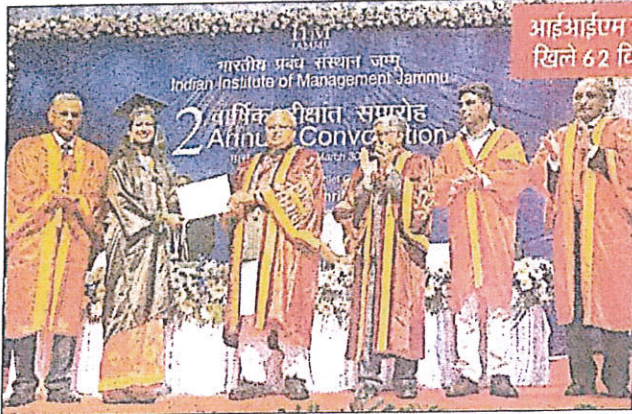
आईआईएम में डिप्लोमा पाकर खिले 62 विद्यार्थियों के रोहरे