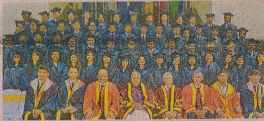
भारतीय प्रबंध संस्थान जम्मू के दूसरे वार्षिक वार्षिक सम्मेलन में डिग्री प्राप्त करने वाले विद्यार्थी राज्यपाल सत्यपाल मुखी व अन्य के साथ

राज्यपाल ने कहा कि मैंने जर्मन हर क्षेत्र के लिए जर्नली हैं। उन्होंने इतिहास