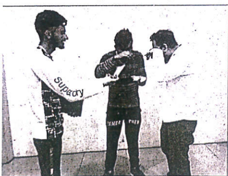
A scene from street play century changes staged by LWWS at Jammu.