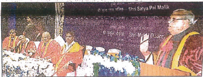
Governor Satya Pal Malik addressing second convocation of IIM, Jammu on Saturday.

"The affluent class is not doing charity. Our 'Seth' (rich) can spend Rs 1,000 crore on the engagement and marriage of his daughter but cannot give Rs 500 crore to any university. If I get the power in my hand, I will force a cess on such people so